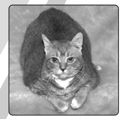
່ ໃໜ້ໂນຂ່ຽ "What could be sweeter than a Twinky?"