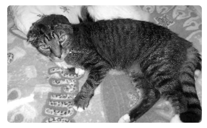
Grandpa could use a good home in his older years

Please come visit our shelter on any weekend from 10 to 4 on Saturdays or 1 to 4 on Sundays to meet some of our older cats. Or visit our website any time at www.catsociety.org to see pictures of some of our cats and see which one might be your new best friend.