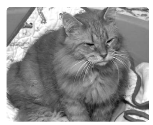
Autumn, your Sponsor-A-Cat spokescat

Volunteers — where would we be without them? We'd be nowhere without them. The Independent Cat Society would not exist!