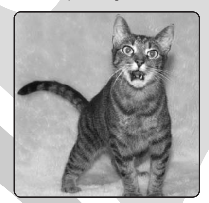
Stripes "I'm always hungry, but especially hungry for your love!"