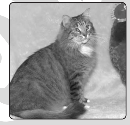
GCOTGC COODCY "I was voted "World's Sexiest Male" by Cat magazine.