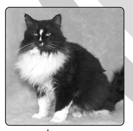
Prince "They don't call me "Prince Charming for nothing!"